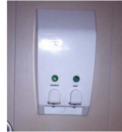
A shampoo and soap dispenser at Hampton Inn, Puerto Rico