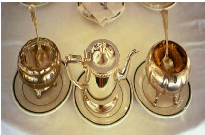
Example of an elegant presentation of bulk sugar at a 5 star Caribbean hotel.