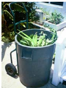
Use cloth bags or wheeled bins to collect yard waste instead of plastic bags.