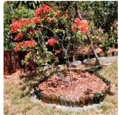
Used wine bottles are re-used to demarcate planting beds at Hotel Mockingbird Hill, Jamaica.

Graywater Beverage bottles Office paper Containers from suppliers Soap bars from guest rooms Old linens Damaged furniture Ink cartridges for printers