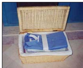
Use baskets or cloth bags to return guest laundry