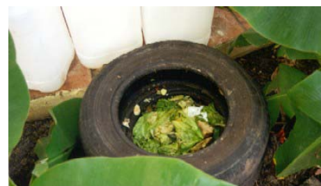
Composting of vegetable left-overs in old car tires at Casuarina Beach Club.