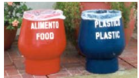
Garbage separation bins at the Hilton Cartagena.