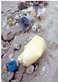
solid waste washed up on a beach

Small hotels should therefore seek to develop a solid waste management plan that follow three practical steps.