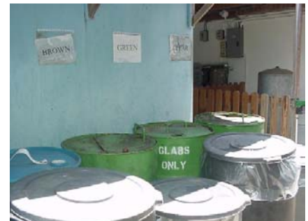
Glass recycling at Negril Cabins, Jamaica

Organic waste (kitchen and yard scraps) Paper Glass bottles and jars Aluminum cans and foil Steel cans and steel scrap Used cooking oil Motor oil