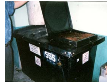
A grease (frying oil) collector

Garbage should be separated into items which can be reused, composted, or recycled, and the remaining portion for the dump or landfill. La Cabana Beach Resort in Aruba has reduced the amount of garbage they send to the landfill by over 80% through garbage separation, composting and recycling.