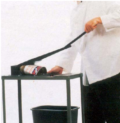
An easy to use hand- operated steel can crusher. Cans and plastic containers should be crushed before disposal in order to decrease the volume of waste that needs to be dealt with.