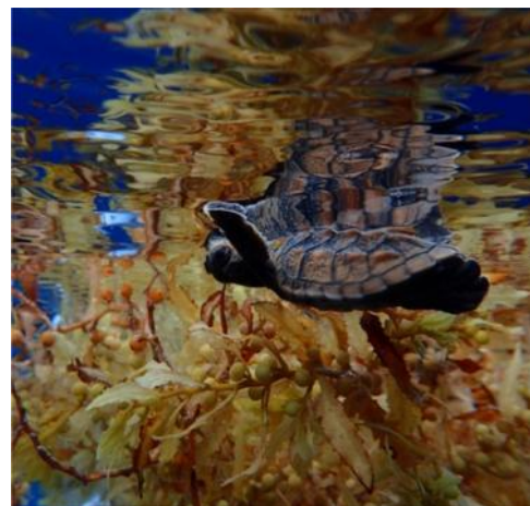
Sea turtle hatchling among sargassum

Where possible, it is generally agreed that in-water collection very close to shore is often preferable to beach collection, where permitted. This approach avoids removal of sand and damage to coastal vegetation. Concern for the conservation of species associated with the sargassum is warranted if the sargassum were to be collected in open water. However, by the time the sargassum rafts are very close to stranding, the majority of associated organisms will have already abandoned the raft, or will wash ashore