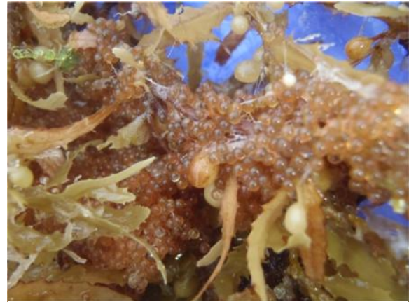
Flyingfish eggs on sargassum.

While a potential nuisance on land when it occurs as an influx of massive quantities, floating rafts of sargassum in the open ocean form rich pelagic ecosystems which provide critical habitats for a diversity of marine species. These sargassum rafts provide refuge and food for over 250 species of fish and marine invertebrates, some of which are not found anywhere else (e.g. the iconic sargassum anglerfish). The rafts serve as important feeding grounds for migratory and commercially important species such as dolphinfish and tuna; act as spawning areas for flyingfish and eels; and as nursery grounds for endangered sea turtles. In addition, various species of seabirds (e.g. terns and boobies) forage among the seaweed. As sargassum ages and loses its buoyancy, it sinks to the ocean floor, contributing to nutrient cycling. Beached sargassum can also be beneficial by providing rich shorebird foraging areas and helping to reduce beach erosion by binding sand and providing extra nutrients for the growth of shoreline plants. It is therefore not surprising that pelagic sargassum has been designated in the United States as an 'Essential Fish Habitat' because of its ecological value and is managed by the US South Atlantic Fishery Management Council according to a 2002 Fishery Management Plan for Pelagic Sargassum Habitat. Within the Sargasso Sea it also receives special conservation attention by members of the newly formed international Sargasso Sea Commission.