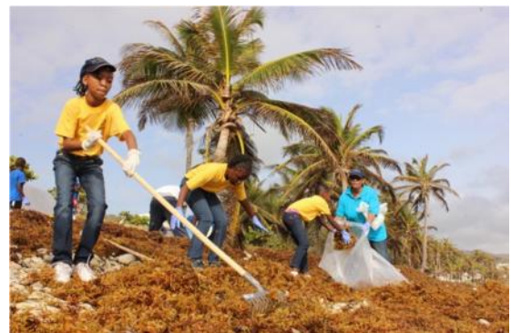
Beach clean-up with volunteers, Bathsheba, Barbados.

because it is less intrusive and reduces the likelihood of disturbing sea turtle nests and