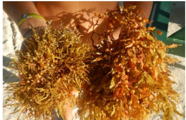
Sargassum natans & S. fluitans . ocean surface.

The sargassum species typically associated with the Sargasso Sea are the same species that have made up the recent mass intrusions in the Wider Caribbean and West Africa. These are Sargassum natans (common gulfweed) and Sargassum fluitans (broad-toothed gulfweed); both of which are native to the North Atlantic