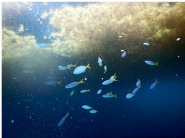
Floating sargassum with associated pelagic fishes.

Sargassum is a brown marine alga (seaweed) which is generally associated with the Sargasso Sea of the North Atlantic Ocean. It is made up of leafy appendages, branches and round, berry-like structures. These “berries” are actually gas-filled structures (mostly oxygen) which aid in buoyancy, allowing the sargassum to float on the