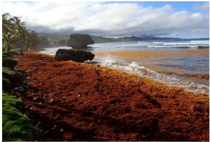
Mass stranding of sargassum on beach at Bathsheba, Barbados.

The purpose of this management brief is to enable government officials, coastal managers, beach caretakers and coastal residents to get ahead of the “ golden tides ” by providing up-to-date information on the recent ‘sargassum influxes’ (arrival of unprecedented mass quantities of sargassum seaweed) in the Caribbean region; and, importantly, by offering guidance on how best to sustainably manage the seaweed, based on lessons learnt to date. This first brief focuses on the immediate problem of clean-up, after mass strandings of the weed. Others will be developed that focus on potential commercial uses of the weed and on adaptation measures suitable for fishers and other vessel operators. This is all part of the on-going efforts by The University of the West Indies and a number of other institutions in the Wider Caribbean to actively research and understand this new phenomenon and develop solutions.