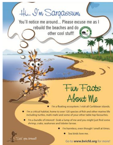
Example of poster in the British Virgin Islands.

by the UNEP-CEP Regional Activities Centre for SPAW