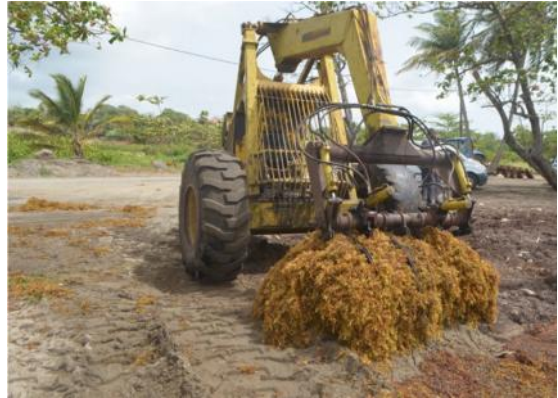
Using a cane-loader to collect large quantities of sargassum in Guadeloupe.

top and bottom layers of seaweed. In some countries a front-end loader with large load-bearing tyres has been used to remove the huge quantities. This has been effective when used to remove only the top layer without touching the sand and then a mechanised rake or manual removal is used to collect the rest. In the French Antilles they have experimented successfully with using cane loaders to pick up large quantities of sargassum, prior to clearing with a mechanised beach rake.