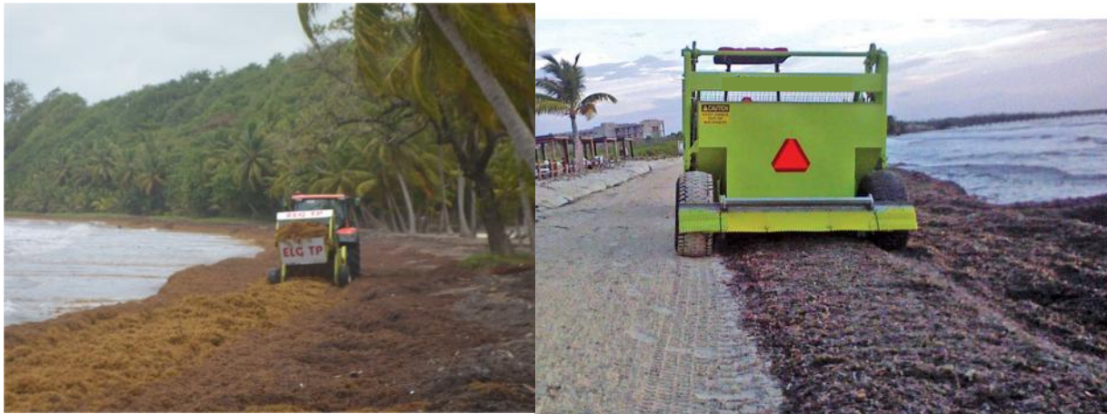
Mechanised beach rakes in action in Guadeloupe (left) and picking up sargassum, in Mexico (right).

Where manual pick up is not practical, mechanical equipment will have to be used and adequate storage and/or disposal of the collected seaweed must be organised. Mechanical beach rakes with a perforated conveyor belt and soft tyres have been found to be effective and work best with moderate quantities of weed and on beaches with low relief and easy access. Note however that