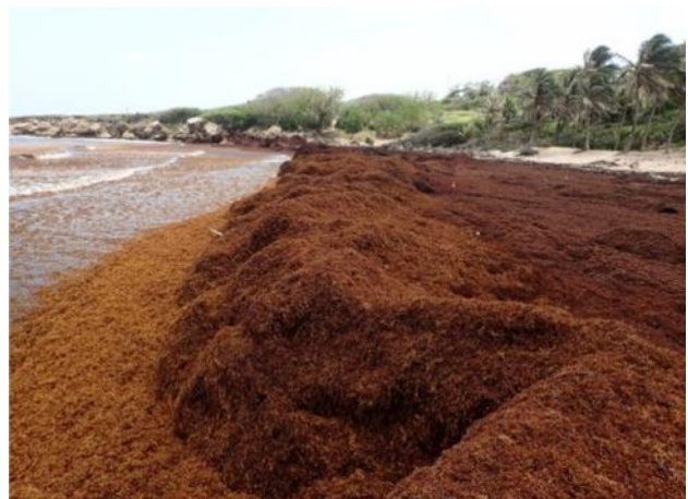
Barrier of sargassum along the shore of Skeetes Bay, Barbados.

this equipment alone will not be adequate for very large accumulations of seaweed. With mass inundations when sargassum piles up along the shorelines forming barriers several metres high, a combination of removal methods is likely to be required. In cases like this, the sargassum should be removed as soon as possible after arrival to avoid vast accumulations of the seaweed along the tideline which decomposes and serves to trap more weed in the water and form dark brown plumes nearshore. In such cases a multi-level approach will be needed, where different equipment is used to remove the