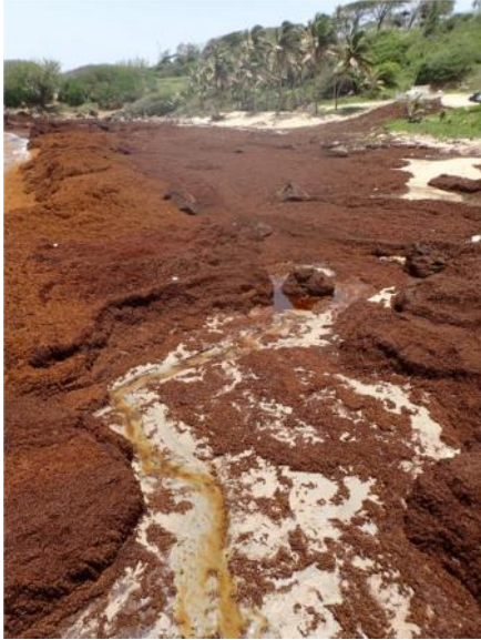
Decomposing sargassum along the shore.

Stranded sargassum can lead to beach fouling and reduce their attraction significantly, even more so when associated with entrapped anthropogenic litter such as plastics and hazardous medical wastes. As sargassum builds up along the shoreline, often becoming several metres thick, it can limit swimming and access to nearshore boat moorings and harbours, and prevent watersports activities.