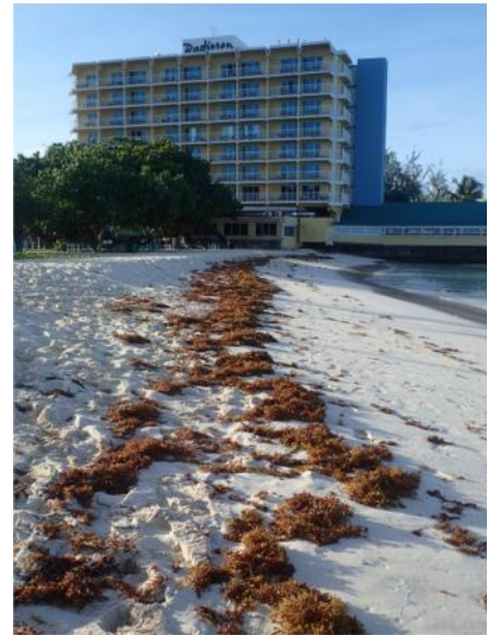
Small amounts of sargassum along the tideline are better left alone.

The most sustainable practice is almost always to let nature be. If sargassum washes ashore in small quantities or inaccessible, non-tourist or non-critical locations, it is generally preferable to leave the seaweed where it is. This has proven to be the simplest and least costly approach, and has the added benefits of potentially nourishing beaches and stabilising the shoreline. During decomposition of large amounts of weed there will inevitably be a smell and insects around; but, experience in locations that have left the sargassum on the beach is that it will eventually get washed away, buried by the next high waves, or sun dried, eliminating the smell.