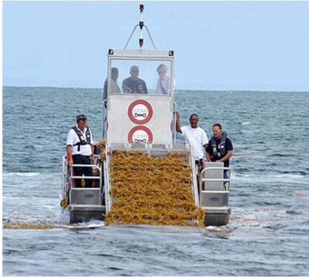
Specialised barge for picking up sargassum.

and be lost anyway. With that said, special care should always be taken with the removal of sargassum close inshore along sea turtle nesting beaches, as hatchlings leaving the beach will hide and remain in the weed.