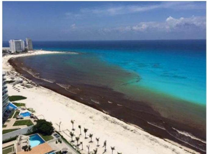
Mass influx of sargassum decomposing near shore and producing a dark brown plume

the shoreline and unable to dry out. The smell and flies may in part be attributed to the presence of dead and dying organisms caught within the rafts, but the decay of tons of seaweed alone can lead to anoxia (oxygen-deprived conditions in the water) and the build-up of poisonous hydrogen sulphide gas, which smells awful and is harmful to most marine animals. Prolonged exposure to high concentrations of hydrogen sulphide gas can also cause human health problems (including nausea, headaches, skin rash and even breathing difficulties) and can tarnish metals (coins, bathroom fittings, door knobs, even jewellery etc.) as well as damage sensitive electronic appliances (TVs, computers, air-conditioning units). As a result, insurance companies in the French Antilles are now covering losses caused by the hydrogen sulphide emitted by sargassum. Furthermore, decaying sargassum trapped along the waterline results in aesthetically unpleasant brown plumes in the water, which are also a threat to the health of critical ecosystems such as coral reefs due to the low oxygen content and high levels of nutrients.