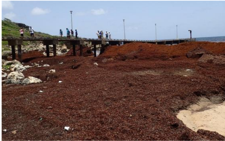
Inundation of Skeetes Bay, Barbados with sargassum.

Observations from the Sargasso Sea indicate that free-floating sargassum circulates seasonally between the Gulf of Mexico and North Atlantic, and exhibits considerable inter-annual variation in biomass of the seaweed and in frequency and volume of shoreline strandings. This year to