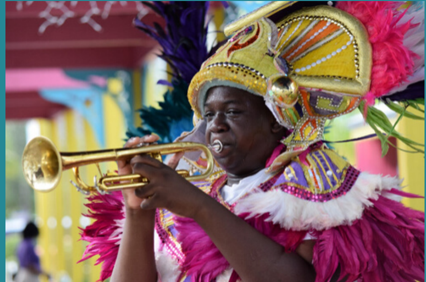
Photo: The Bahamas Junkanoo Festival

January 21-23, 2020: CHTA Caribbean Travel Market Place, Nassau, Bahamas