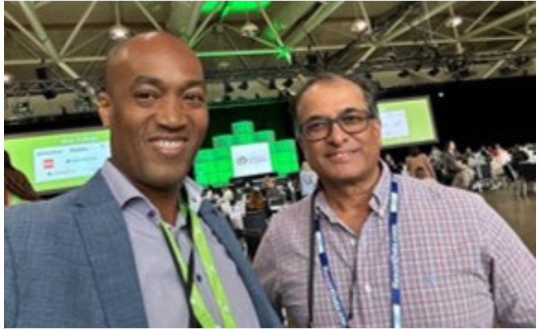
CHTA members at the Hospitality Industry Technology Exposition and Conference (HITEC) IN Toronto, Canada in 2023

The Caribbean Hotel and Tourism Association (CHTA) has been a driving force in technology innovation and industry partnerships. Through a memorandum of understanding (MoU) with Hospitality and Tourism Professionals (HFTP), CHTA provides its members with cutting-edge technology insights and opportunities, fostering valuable contacts and educational avenues.